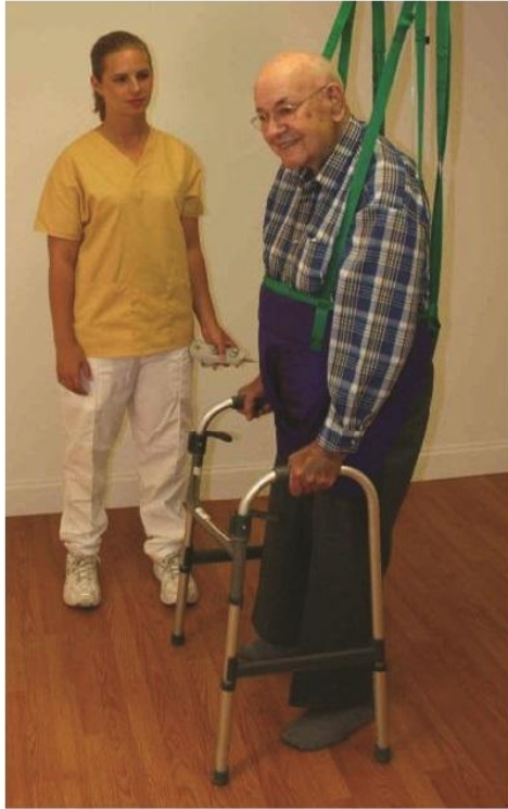
The Walking Pants can only be applied as depicted above so that the Loop Straps 1a and 1b are at the back and over the coccyx (tailbone).